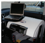
Mobile X-Ray Unit

Laptop Computer with Verizon Wireless card with Global VPN client using the OREX CR unit